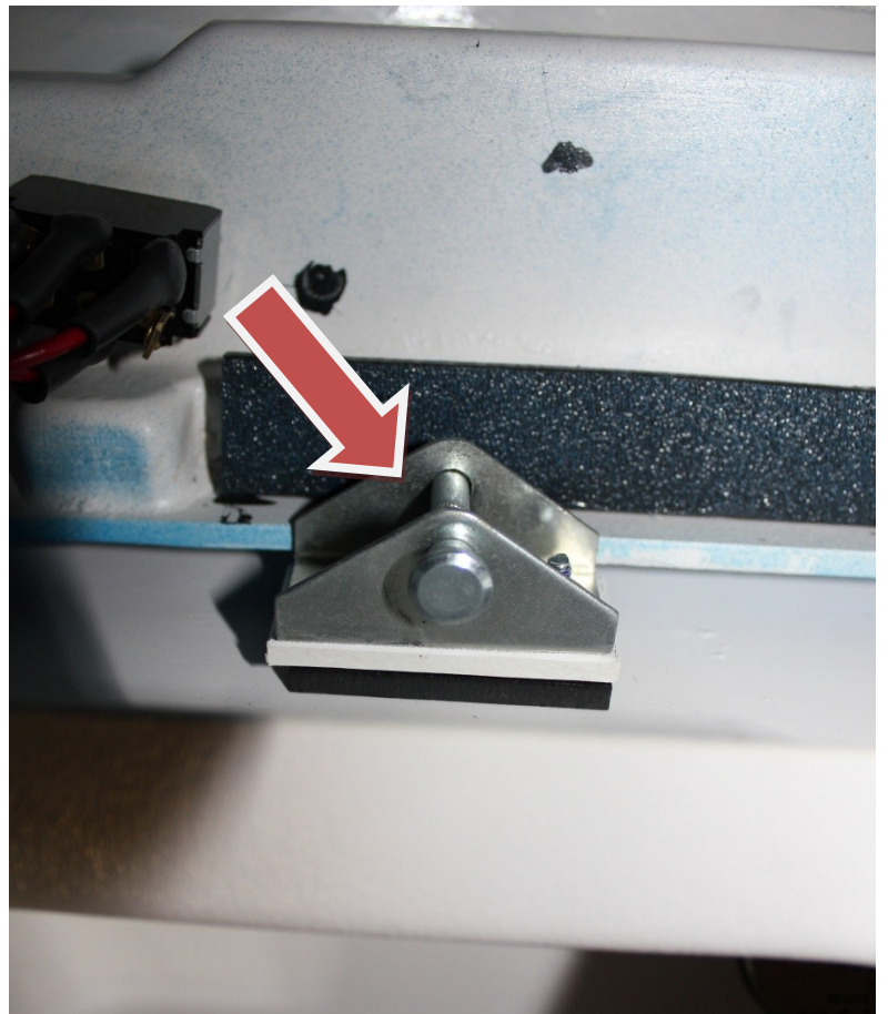
All four locking pins to hold top in place must be in locked position. Pin pushed in. (above)