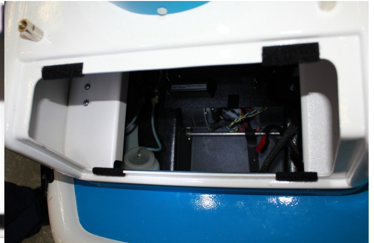
Always remove battery for transportation.